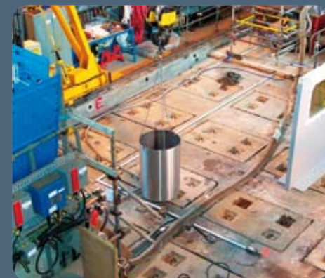
Fuel Element Debris: Bradwell leading on cross-site delivery of dissolution