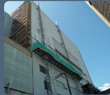
Asset management: all assets assessed and graded to prioritise spend