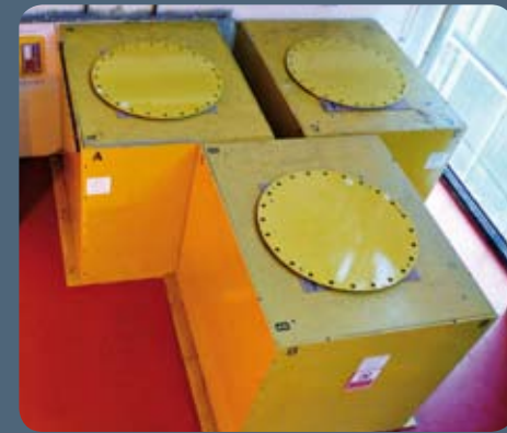
MiniStores: concept and associated delivery plans developed