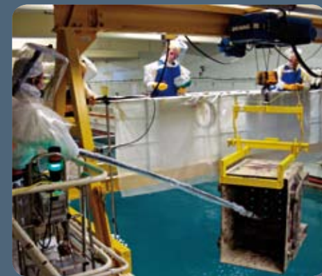
Ponds: cross-site working developed to share expertise